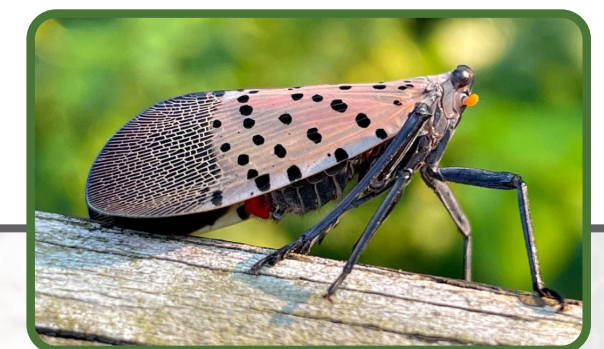
Spotted Lanternfly

You can help curb the spread of invasive species by learning more and taking action if you discover them in your yard. High on the list of concern are Japanese barberry, Japanese wineberry, and tree of heaven. Tree of heaven is also a favorite food plant for the spotted lanternfly that attacks native trees and shrubs as well as fruit trees and other crops. For more information check out FL-PRISM's website at fingerlakesinvasives.org .